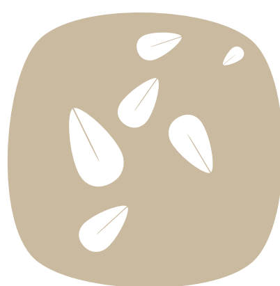
11 Sesame seeds