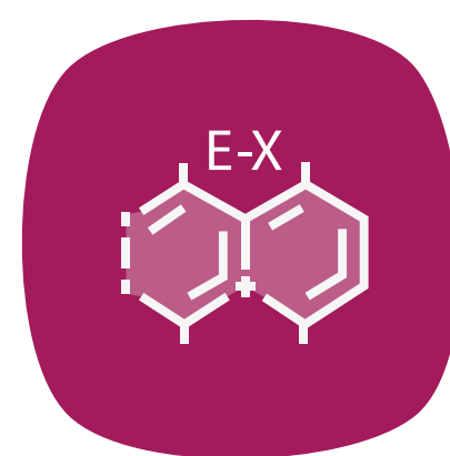
12 Sulfur dioxide